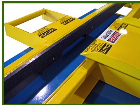
Or A 4x4... In A Single Pass